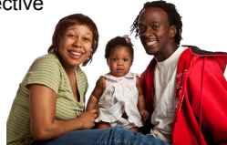
Wilder Research and Development & Training, Inc.