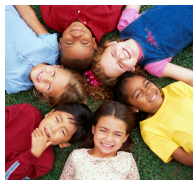
Wilder Research and Development & Training, Inc.