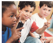
Wilder Research and Development & Training, Inc.